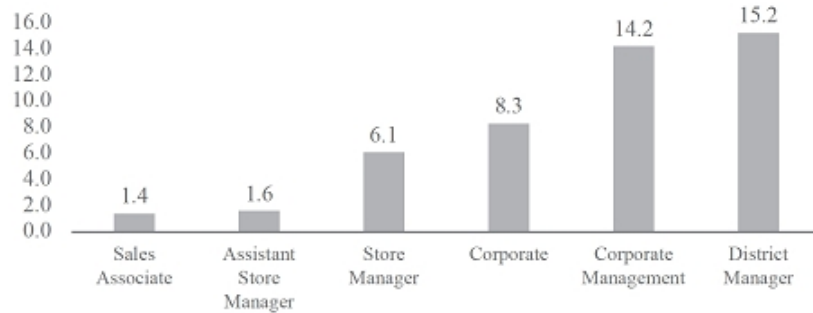
Average Years of Service By Position

We believe that our Company culture helps to retain our associates. We have several associates with more than 40 years of service. The Average Years of Service By Position graph is for active associates as of December 31, 2021.